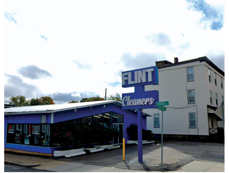
Flint Cleaners in Allston is poised to move into a completely new building, with seven stories above the ground-floor retail.