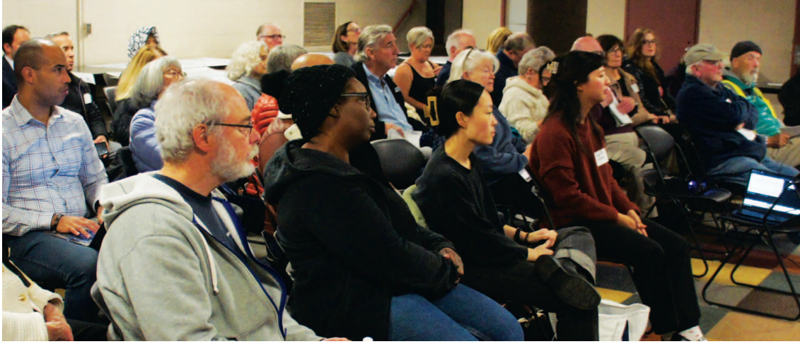
Residents spoke their minds at last year's meetings for the new zoning initiative, and more is expected in meetings posted for this summer.