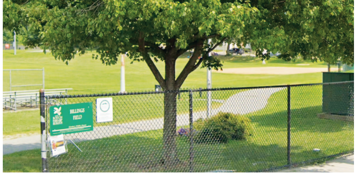
Most people in West Roxbury know Billings Field, but how many know about its namesake?

One challenge Billings faced when running his business was poor road conditions. County Road wound around hills and wetlands, and was often filled with mud or dust. In the winter, the road would freeze for months. Benjamin relied on these local routes to use oxen to transport heavy supplies such as granite,