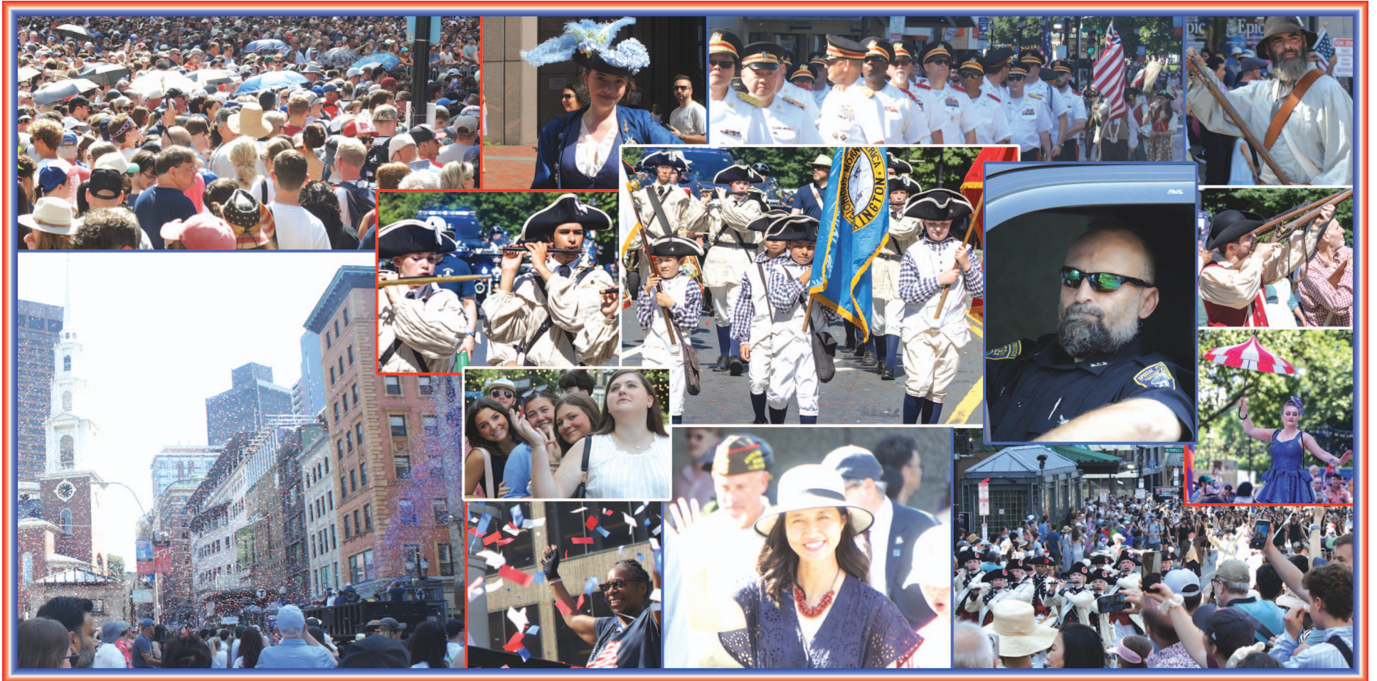
Tens of thousands braved the warm weather on Saturday to celebrate the 250th anniversary of the Declaration of Independence in Boston.